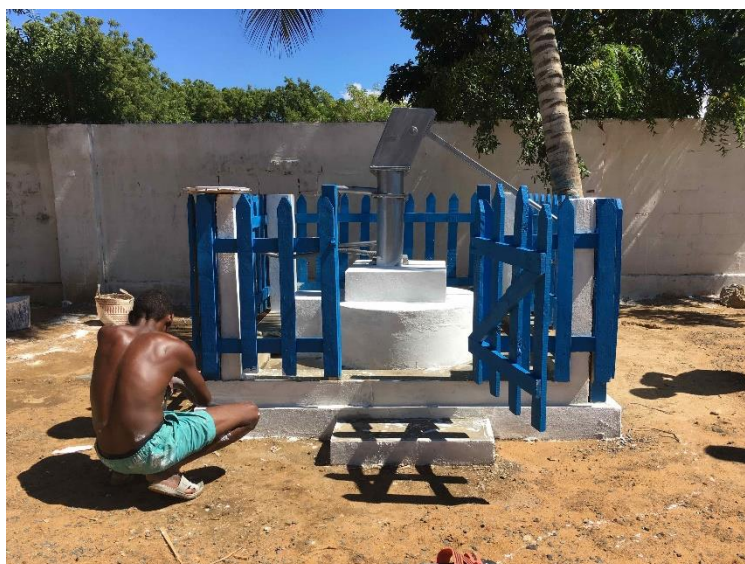
Imagine A-1. Example of project scenario

The project activity includes the excavation of water supply systems which will be equipped with manual pumps to extract the water from the boreholes. The fences will be constructed around each borehole for protection purposes. (Imagine A-1). Total five boreholes are included in this VPA.